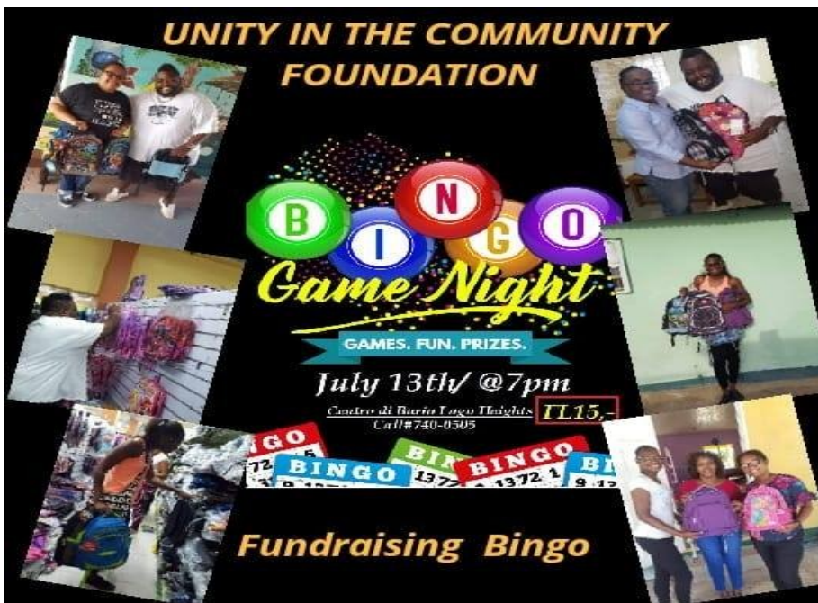
Bingo Time: July 13 th 7pm at Centro di bario lago heights

A section of San Nicolaas' main street has been converted to a picturesque promenade with shops containing souvenirs, crafts and local snacks. In nearby Seroe Colorado, there is a small natural bridge, not to be confused with the bridge at Andicuri. To view the bridge follow the road to its terminus, then hike approximately 200 feet (61m) down old lava and coral formations.